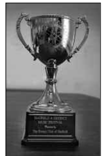
The Rotary cup, presented to the winner of the Piano section

There will also be cash prizes and trophies for other classes in all categories as detailed in this Syllabus.